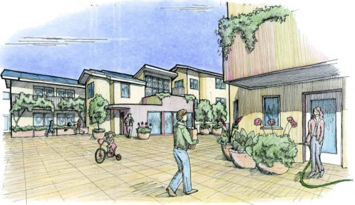
The roof of the garage features large courtyards and extensive plantings

A nd the interior design has the best features of modern design. The Living, Dining, and Kitchen spaces open to each other to provide large views and flexible use. Most homes have a flexible room that can function as a third bedroom, guest room, den or home office. Home-based businesses reduce environmental impacts and increase safety and security within the neighborhood. Interior spaces on the upper levels have vaulted ceilings and large windows. Interior walls will glisten with natural plasters that give a beautiful texture and warmth.