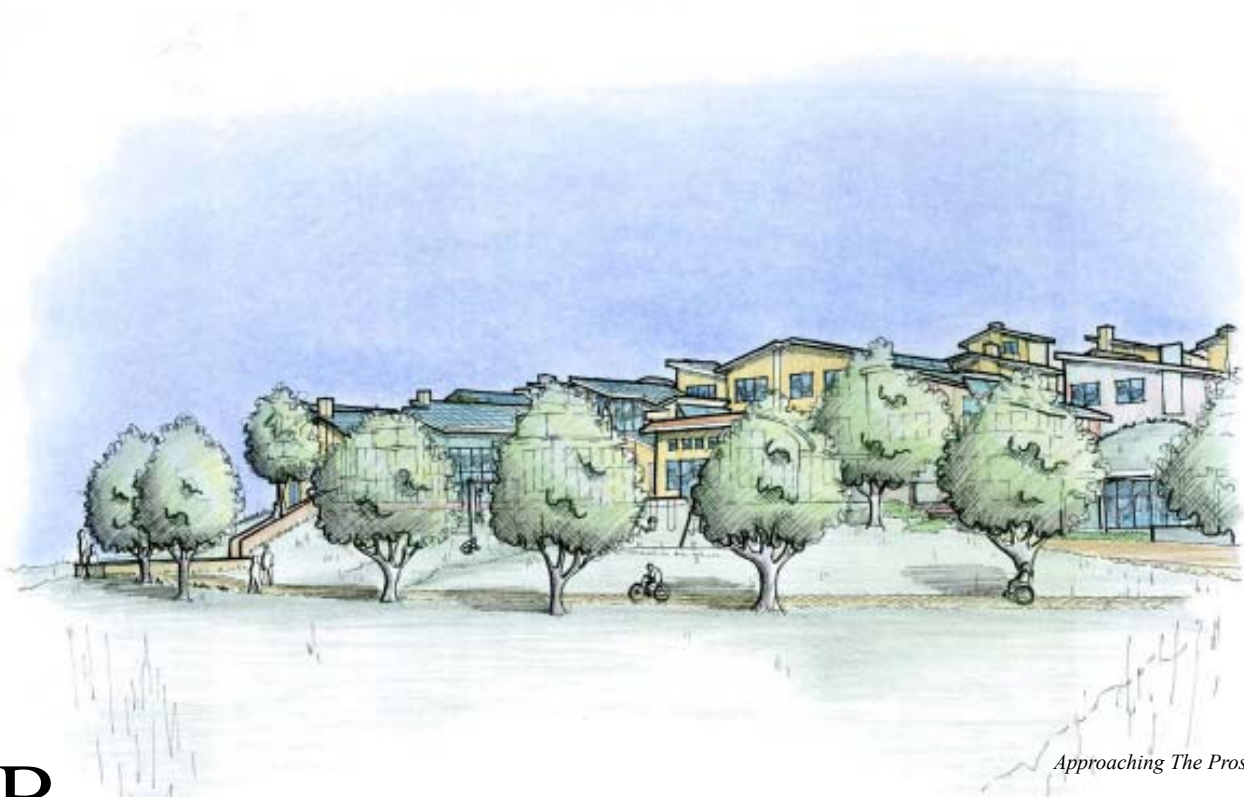
Approaching The Prospects

B uildings at The Prospects will address energy, water, food, materials, and waste, all while promoting personal health. Our goal is to make the Prospects the first zero energy community in San Mateo County with passive solar heating, insulation far in excess of building codes, solar thermal panels, and photovoltaic panels to generate electricity. There will be enough electricity generated on-site to power an electric or plug-in hybrid vehicle for each home! The Prospects will provide rainwater catchment and storage, and dual plumbing to re-use water for toilet flushing and landscaping, and residential graywater systems. Extensive on-site Community Gardens will provide fresh organic fruits and vegetables for residents. Building materials will be selected that are both durable and that have responsible environment sources. Site facilities will include on-site composting, recycling and water treatment to minimize waste.