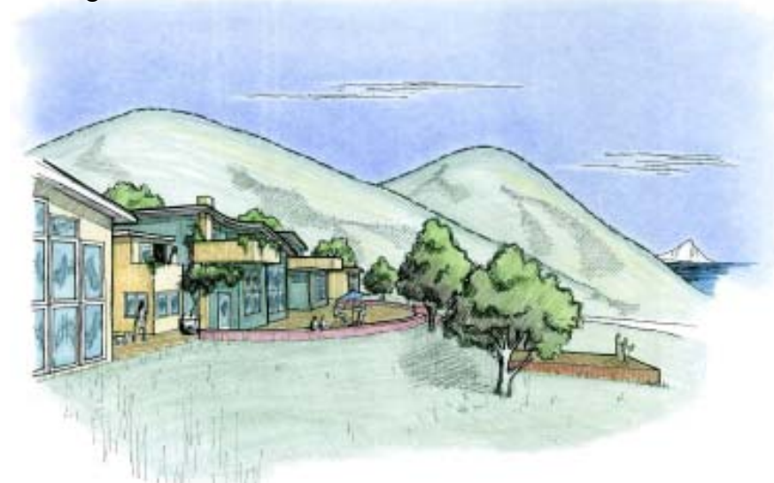
The West Plaza with views of the Pacific Ocean (650)359-3827

The natural and native landscape will have reduced mowing and maintenance costs, and avoiding the pollutants associated with lawn care will improve the local environment and save costs associated with removing those contaminants from the storm sewer system.