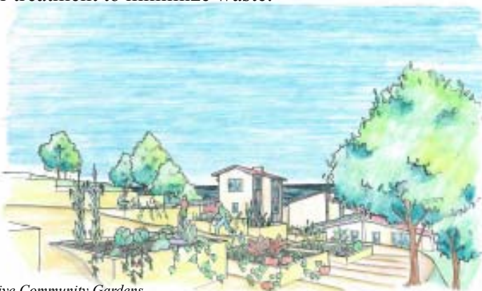
Extensive Community Gardens will provide fresh fruits and vegetables Pacifica Prospects, LLC.

B uildings at The Prospects will address energy, water, food, materials, and waste, all while promoting personal health. Our goal is to make the Prospects the first zero energy community in San Mateo County with passive solar heating, insulation far in excess of building codes, solar thermal panels, and photovoltaic panels to generate electricity. There will be enough electricity generated on-site to power an electric or plug-in hybrid vehicle for each home! The Prospects will provide rainwater catchment and storage, and dual plumbing to re-use water for toilet flushing and landscaping, and residential graywater systems. Extensive on-site Community Gardens will provide fresh organic fruits and vegetables for residents. Building materials will be selected that are both durable and that have responsible environment sources. Site facilities will include on-site composting, recycling and water treatment to minimize waste.