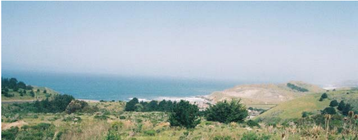
Ocean panorama from the site

T he Prospects is designed to embrace the beauty of its site, both environmentally and visually. Parking for the entire complex will be in an underground garage with 17 units of housing built on the podium. This allows us to minimize roads, with only 100 feet of visible driveway. Without surface paving, the project will be completely open for adults and children to walk, relax, and play without automobile interference.