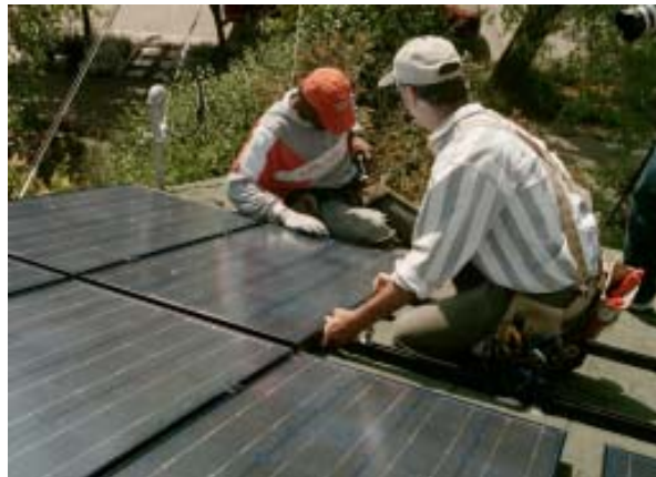
Large amounts of south facing glass provide passive solar heating; solar thermal panels heat water and photovoltaic panels produce electricity