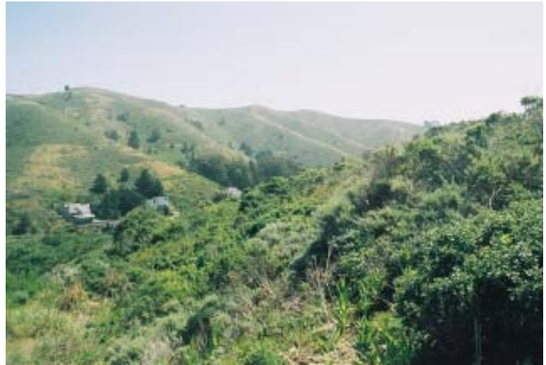
View from the Site to the Pacifica Hills

Reducing the built footprint leaves more space open as greenspace and maintains the viewscales that make a community attractive. This also reduces the costs of maintaining roads. Natural ecosystems maximize the use of the free “ecosystem services”, including water and air purification, management of erosion and sediment runoff, and pest control. Extensive plantings will also aide carbon sequestration by absorbing carbon dioxide - a major cause of climate change.