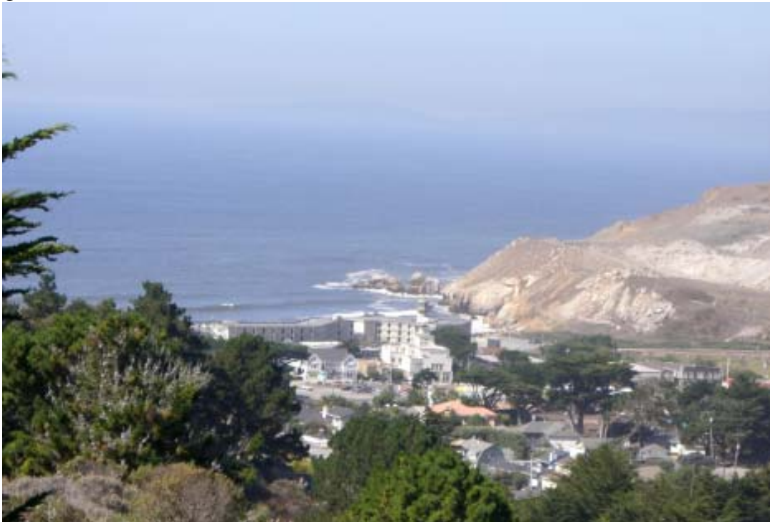
The Rockaway Beach Area of Pacifica

P acifica is unique in the greater San Francisco Bay Area. It is a tight community, with a relaxed, small town atmosphere. And the Pacific Ocean lends more than its name to the town. With pleasing ocean breezes, Pacifica enjoys a moderate climate and the cleanest air anywhere. The rolling hills provide amazing views to miles of the coast, including the Farallone Islands and Point Reyes. Outdoor recreational activities abound, including surfing, biking, hiking, or just relaxing and enjoying nature.