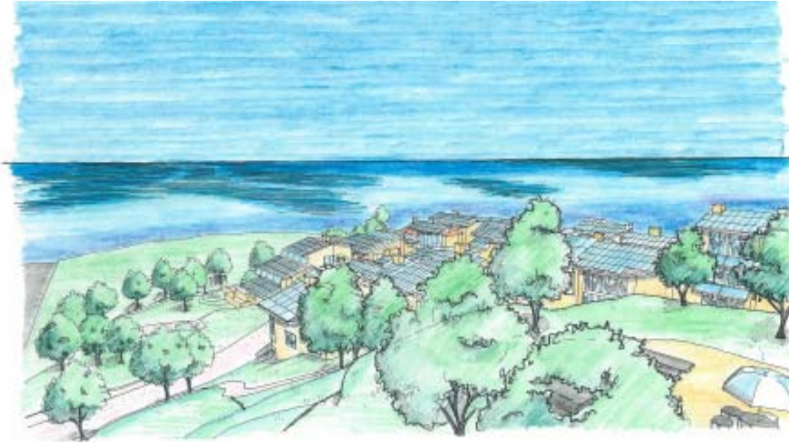
View from the Picnic Grounds above The Prospects

E ach house will be uniquely designed for its specific site, and the designs blend in with the surrounding landscape to create a variety of public, and private outdoor spaces. Averaging less than 1500 square feet, the homes are sized to meet the needs of the residents without excessive use of materials and resources.