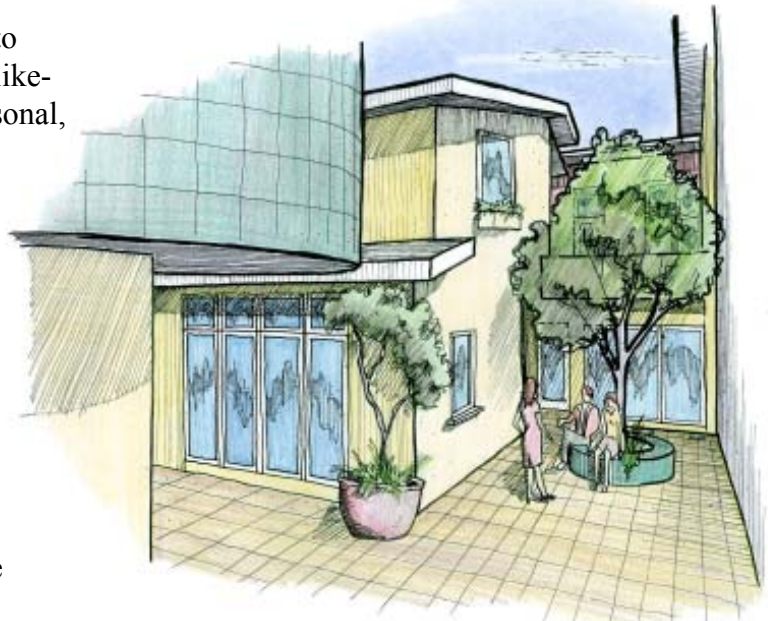
Small Courtyard for quiet gatherings

At the core of The Prospects is the desire to create a strong community of people with like-minded values - restoring health at the personal, local, regional and global levels. We are promoting human health, through healthy heating and cooling systems, natural ventilation, maximizing daylight, eliminating toxic materials, and promoting outdoor activities, walking instead of driving, and providing places for social interaction. We are promoting local and regional health by building and using the services in our local region. We are creating a positive energy community that will reduce our carbon footprint and create a model for sustainable development.