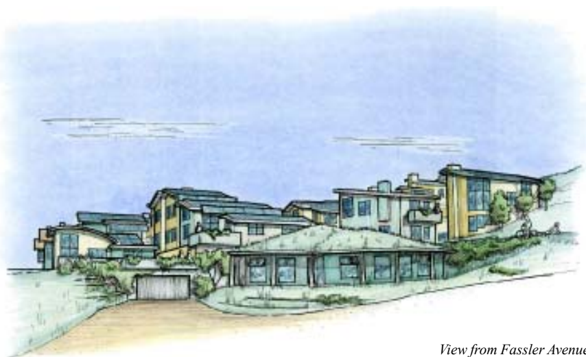
View from Fassler Avenue The Community Room, with a Living Roof, is in the foreground.

The Prospects site is surrounded by open space, giving unparalleled views to the homes. We have provided a variety of paths, plazas, and courtyards within the site that provide spaces for larger groups as well as settings that are more intimate. While developing modern housing, we are looking to historic cities to create our development patterns. In particular, we believe the hillside villages of the Mediterranean are appropriate to both our climate and to the desires of Bay Area residents.