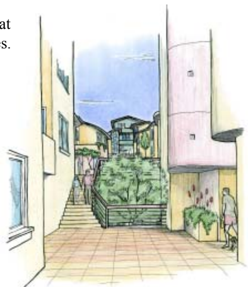
Center Plaza with stairs leading to homes on the hill