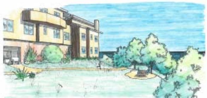
Picnic Areas and Gardens along the north side provide recreation and relaxation

Facilities will also include recreation for children within the community, with playfields and playground equipment to meet the needs of all ages.